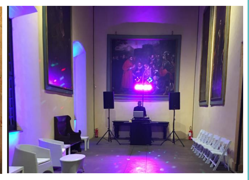
Historical Rooms Justice Room Gallery